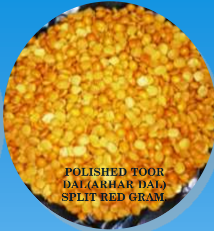
POLISHED TOOR DAL (ARHAR DAL) SPLIT RED GRAM.