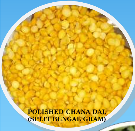
POLISHED CHANA DAL (SPLIT BENGAL GRAM)