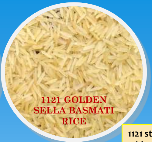
1121 GOLDEN SELLA BASMATI RICE