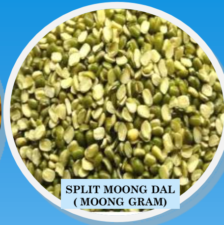
SPLIT MOONG DAL (MOONG GRAM)