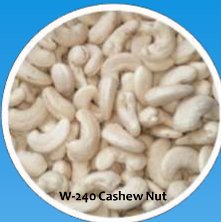
W-240 Cashew Nut