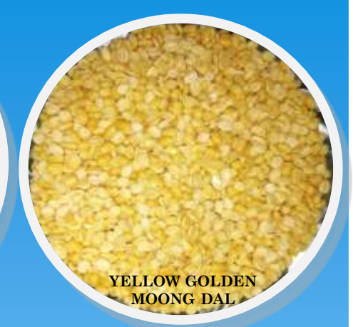
YELLOW GOLDEN MOONG DAL