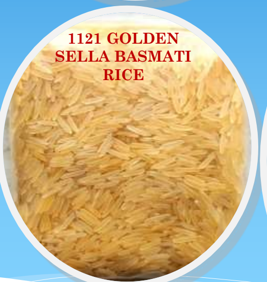
1121 GOLDEN SELLA BASMATI RICE