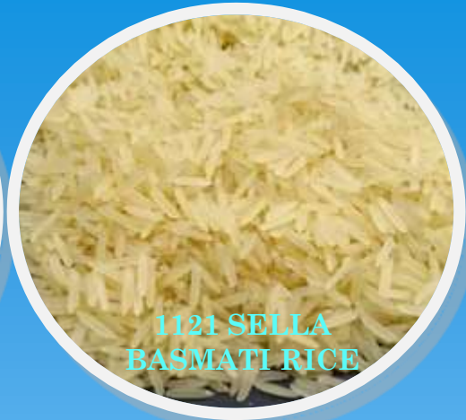
1121 SELLA BASMATI RICE