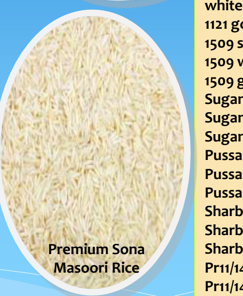
Premium Sona Masoori Rice

1121 steam basmati. 1121 white sella. 1121 golden sella. 1509 steam. 1509 white sella. 1509 golden sella. Sugandha steam. Sugandha sella. Sugandha golden. Pussa 1401 steam. Pussa1401 white sella. Pussa 1401 golden sella. Sharbati sella. Sharbati golden. Sharbati steam. Pr11/14 steam. Pr11/14 raw. Pr11/14 sella. Pr 11 golden.