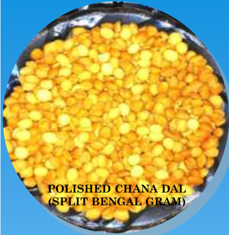
POLISHED CHANA DAL (SPLIT BENGAL GRAM)