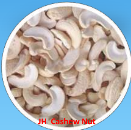
JH Cashew Nut