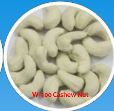
W-400 Cashew Nut