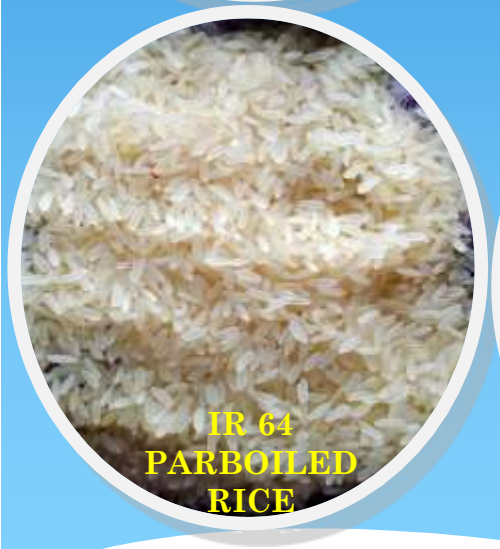
IR 64 PARBOILED RICE