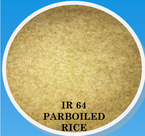
IR 64 PARBOILED RICE