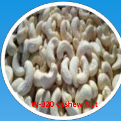
W-320 Cashew Nut