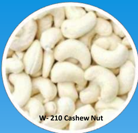
W- 210 Cashew Nut