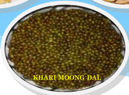
KHARI MOONG DAL