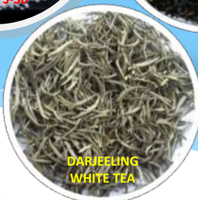
DARJEELING WHITE TEA