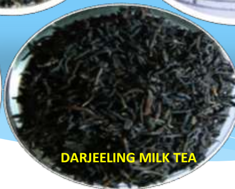
DARJEELING MILK TEA