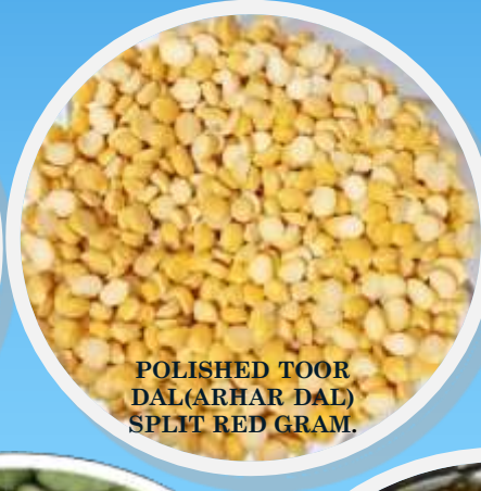
POLISHED TOOR DAL (ARHAR DAL) SPLIT RED GRAM.